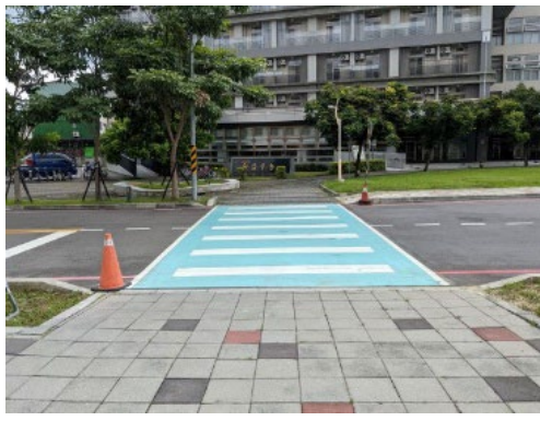
Barrier-free Ramp of Innovation and Research Building