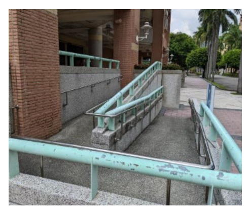
Barrier-free Ramp of Engineering Hall