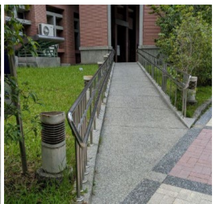
Barrier-free Ramp of Management Hall