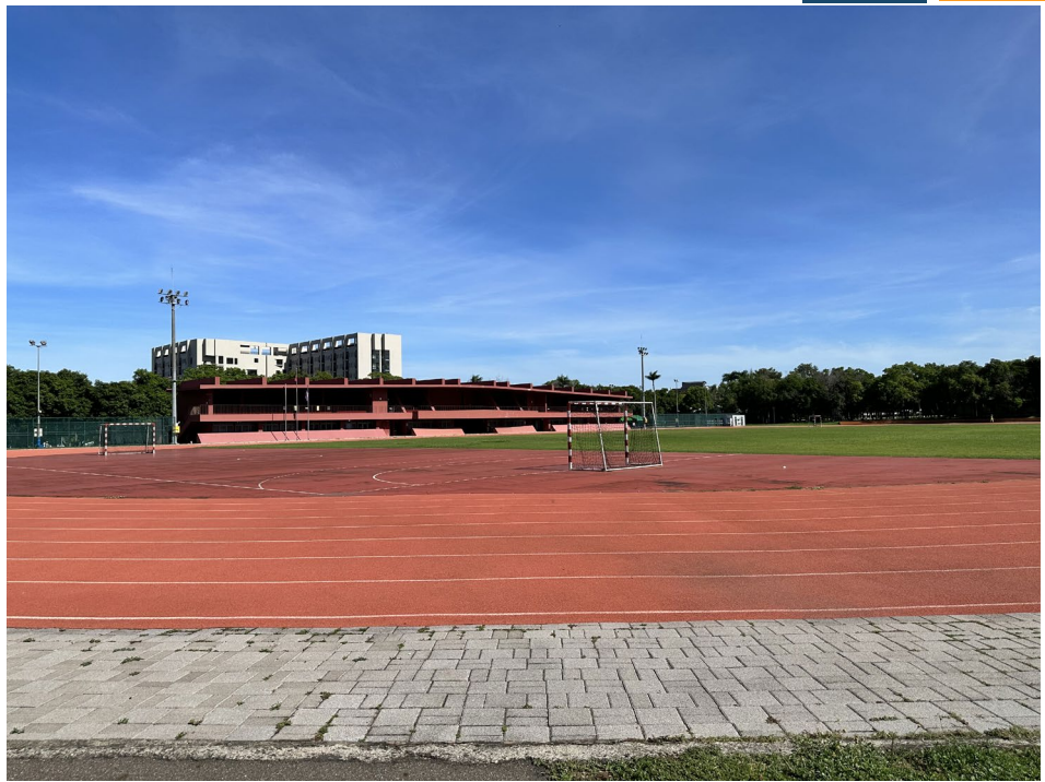
Open Sports Facilities