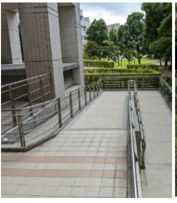
Barrier-free Ramp of Library

In order to establish a sustainable and friendly campus environment, barrier-free ramps have been installed between buildings and sidewalks. Additionally, green zebra crossings have been implemented on the roads of NCUT to enhance visibility at intersections and ensure the safety of students when crossing. These measures are illustrated in the below Figure.