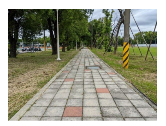
Permeable Pavement of Sidewalk