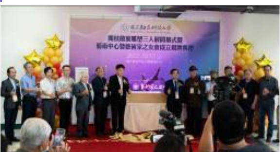
Opening Ceremony of Taiwan Oil Painting Trio Joint Exhibition