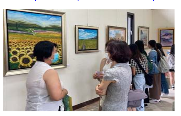
The World of Frames